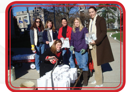
JWC partners with the State Capitol to host the NC State Tree Lighting each December

For more information on becoming a member of the Junior Woman's Club of Raleigh, contact us at info@jwcraleigh.org or call 919-685-1889