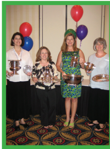
Awards at our yearly State Convention

The JWC of Raleigh offers several avenues for members to become involved in community service. Our club selects projects and programs that best fit our community's needs from the following six community service programs: