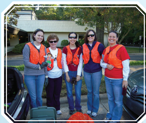
Our Club has supported the Adopt-A-Highway program for over 20 years

The Junior Woman's Club of Raleigh 3300 Woman's Club Drive Raleigh, NC 27612